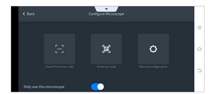
{\it Use the QR code to configure your microscope in the app.}