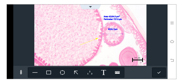
Annotate your images.