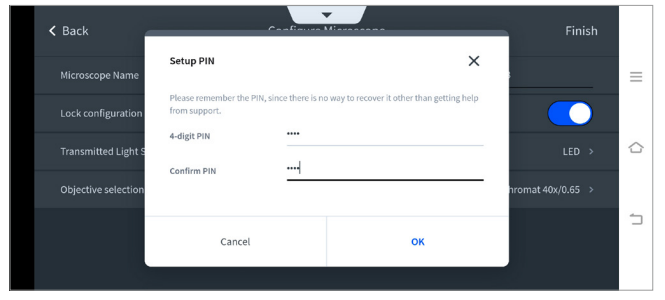
Use a pin to lock or unlock the configuration.