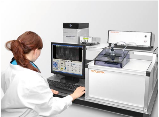
Fig. 2: Member of LLS ROWIAK LaserLabSolutions staff performing service work with TissueSurgeon